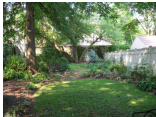
Beds wandering to back