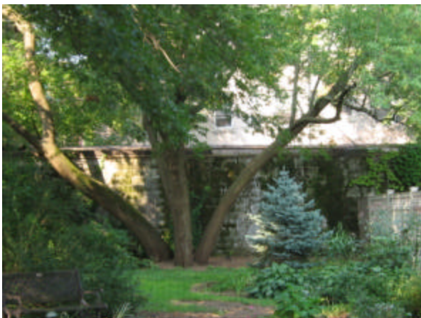
Back wall framing tree