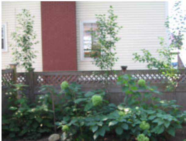
Side newly planted with pears and hydrangea