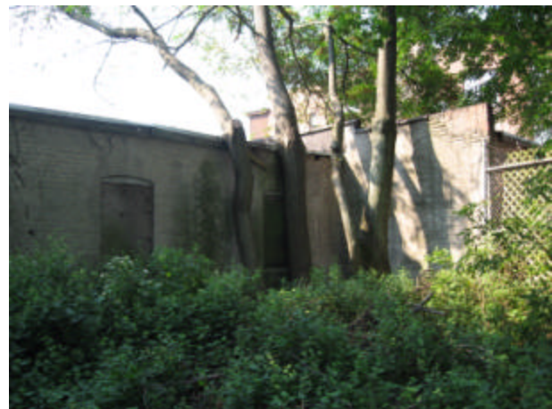
Site for future secret Grecian garden