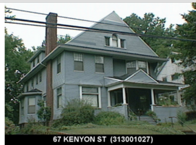
67 KENYON ST (313001027)