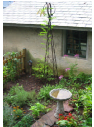
Cleome, wisteria on orb