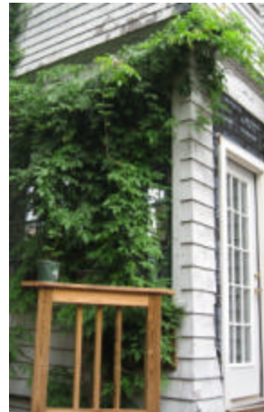
Wisteria – pergola planned