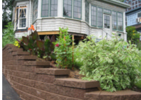
Variegated red stemmed dogwood Zinnias, cosmos, dahlias

Oak Tree Wisteria (plan new pergola over patio) 5-6 peonies Rose arbor Morning Glories Burning Bush Tree Butterfly bush Gooseberry Yucca Poppy Raspberries Dogwood Tree (old wine press) Olive shrub (Russian or Autumn) (Baby cardinals) Barberry Cuphia Bitter sweet (weed)