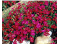
Dianthus Zing Rose