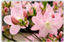
Azalea Royal Azalea