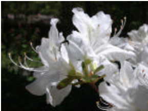
Azalea Glacier White