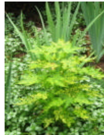
annual flowering Maple Abutilon 'Gold Dust'