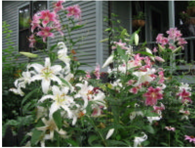
Asiatic lily mix