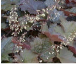
Coral Bells – Purple Palace'