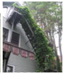
Dutchman's Pipe Vine