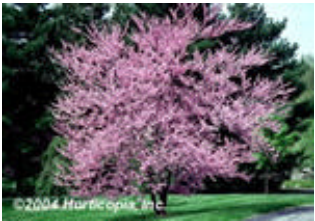
Eastern Redbud Cercis Canadensis