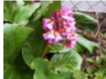
Bergenia – may flowering