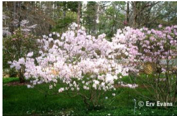
Azalea Royal Azalea