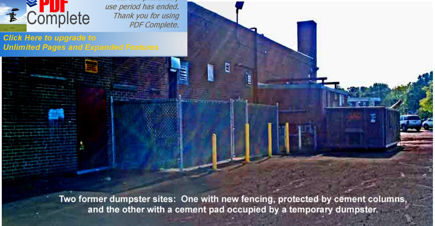
Two former dumpster sites: One with new fencing, protected by cement columns, and the other with a cement pad occupied by a temporary dumpster.

Click Here to upgrade to Unlimited Pages and Expanded Features