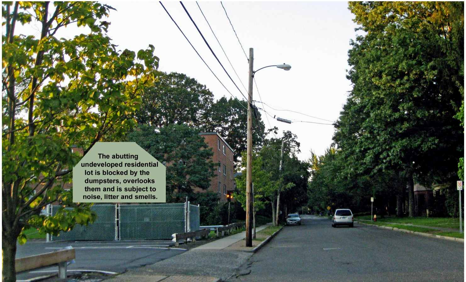
The abutting undeveloped residential lot is blocked by the dumpsters, overlooks them and is subject to noise, litter and smells.