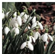
Galanthus elwesii Snowdrops – 4" Full shade to full sun March

About all that was up to see at my house was a small display of crocus – my favorite, Ruby Giant (tommasinianus) – which are actually small but abundant, velvet purple w/ vibrant orange stamen'd blooms that seem to resist the squirrels best - coupled with some blue scilla and lovely early Kaufmannia tulips – 8" that open flat like stars, bright yellow centers with cream petals inside that blush to a lovely sunset color after a few days in the sun. The Ruby Giant and scilla come back year after year. The Kaufmannia – lasts a few years. The snowdrops had passed.