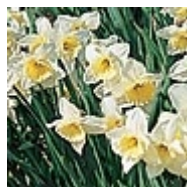
24-Ice Follies (P) 16"+ (Full sun-Part shade) Early April