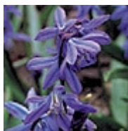
Scilla 4" Part shade - Full Sun March-April