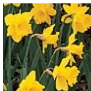
24-Dutch Master (W) 18"+ (Full sun-Part shade) Early April

A handful of early daffodils were just starting to bloom: Unfortunately, an ill-placed snow plow took out a bunch of daffodils and hosta along the side of my drive. Small price to pay to avoid having to shovel that one awful snow-on-ice-on-snow storm.