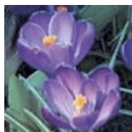
Crocus: Ruby Giant 4" Part shade - Full Sun March-April